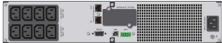
SG 1000 RT and SG 1500 RT