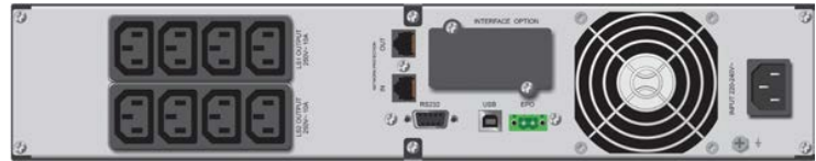
SG 2000 RT