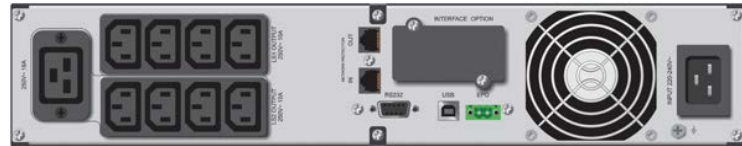
SG 3000 RT